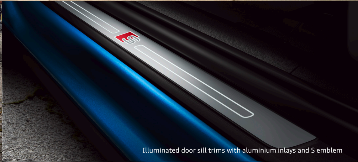
Illuminated door sill trims with aluminium inlays and S emblem