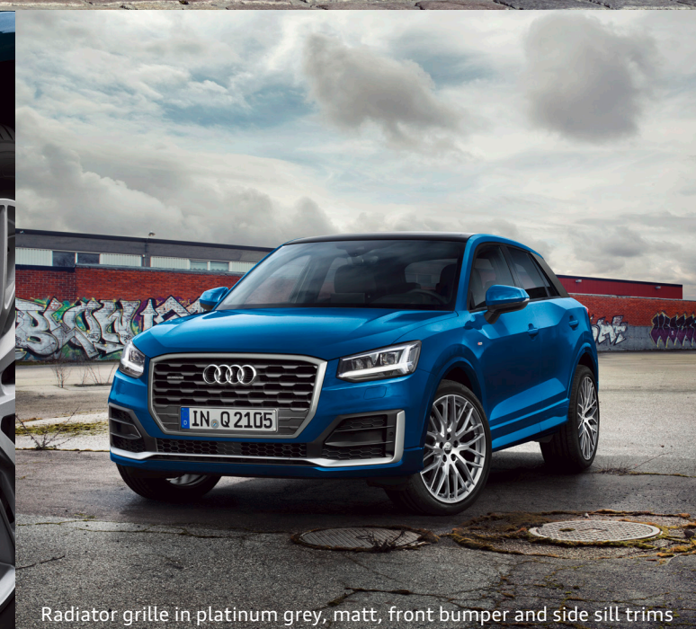
Radiator grille in platinum grey, matt, front bumper and side sill trims in a striking sport design as well as S line emblem on the front wings