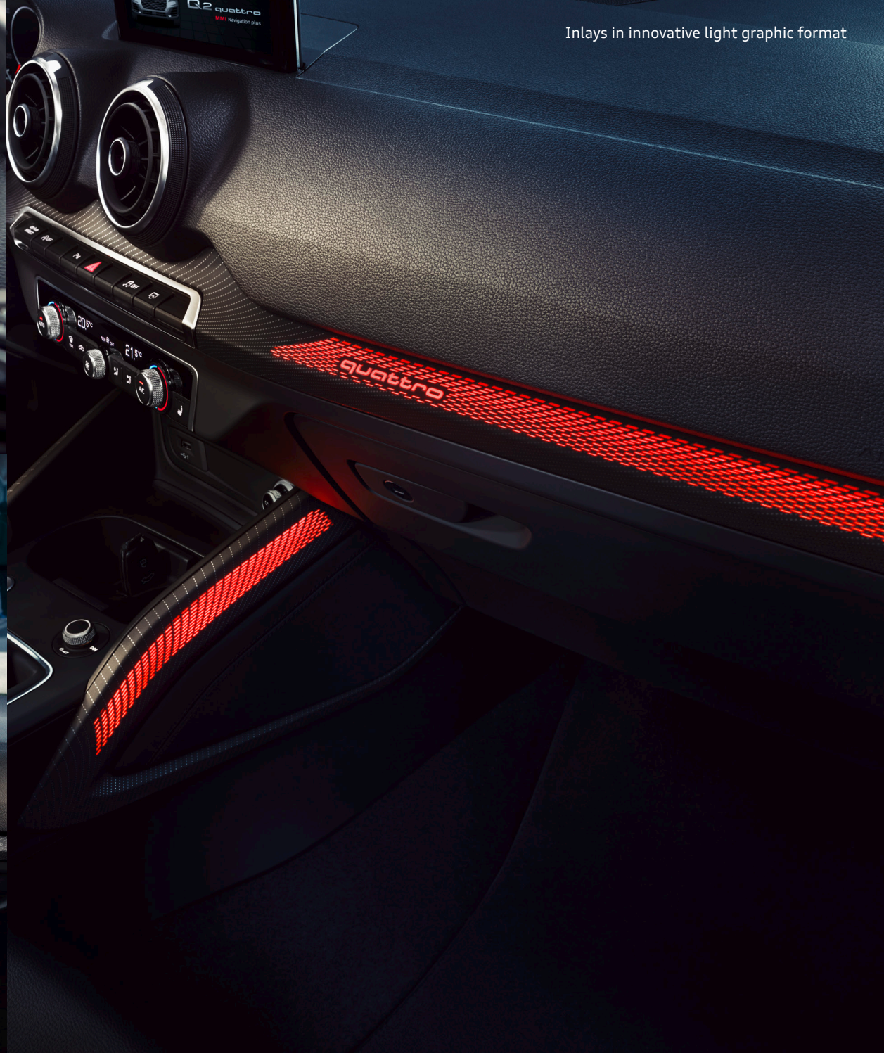
Inlays in innovative light graphic format