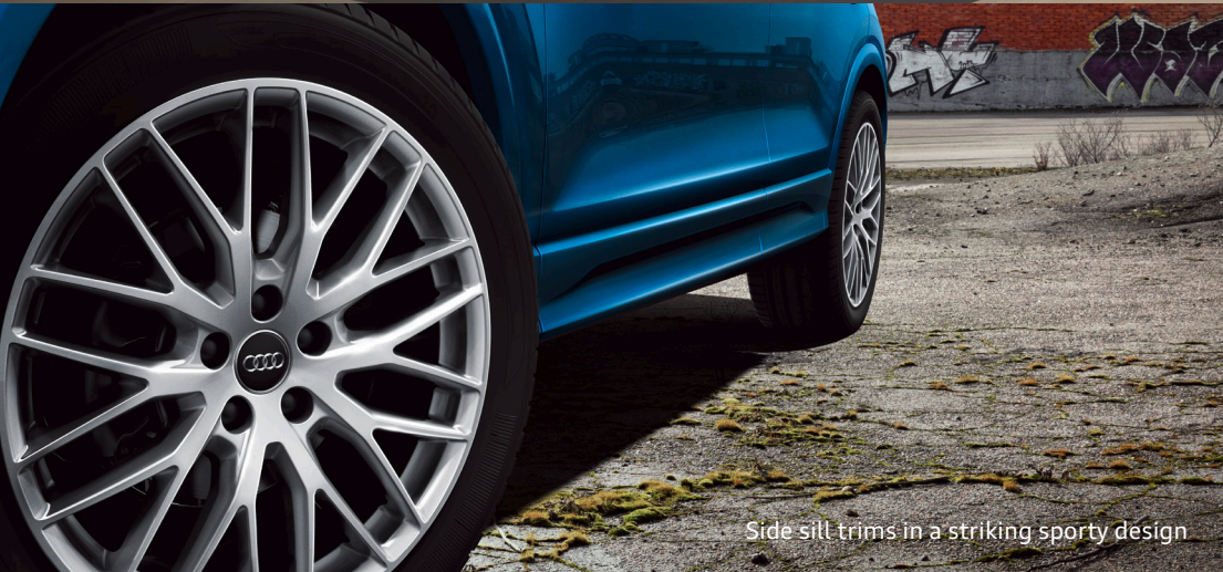
Side sill trims in a striking sporty design

Don't just emphasise the sport character of the Audi Q2 - enhance it. The optional S line exterior package further accentuates the Audi Q2's dynamic body line and uses exciting details to create special highlights.