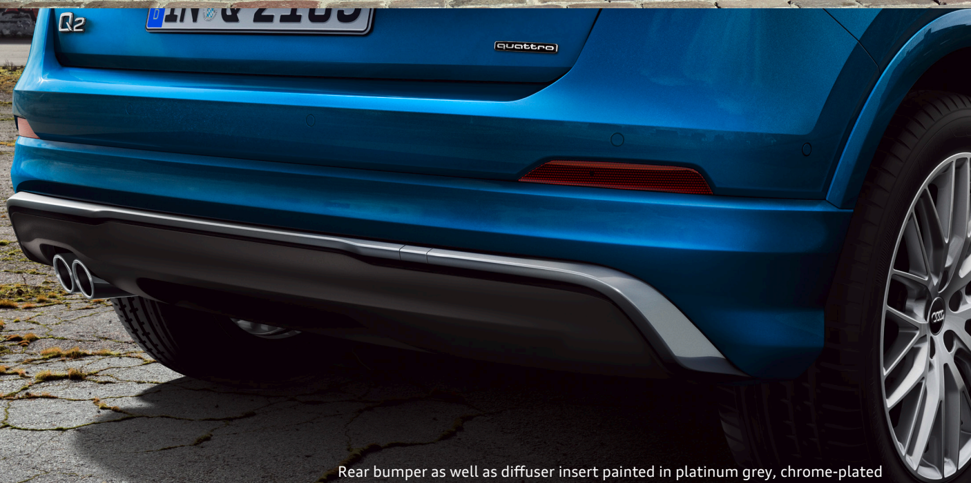
Rear bumper as well as diffuser insert painted in platinum grey, chrome-plated trims for exhaust tailpipes (single or twin depending on engine version)