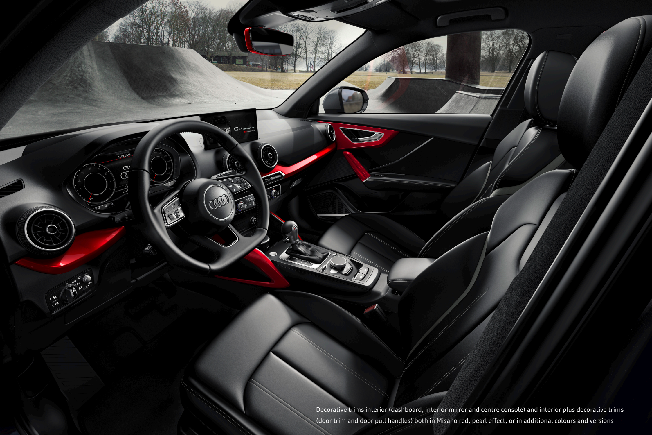
Decorative trims interior (dashboard, interior mirror and centre console) and interior plus decorative trims (door trim and door pull handles) both in Misano red, pearl effect, or in additional colours and versions