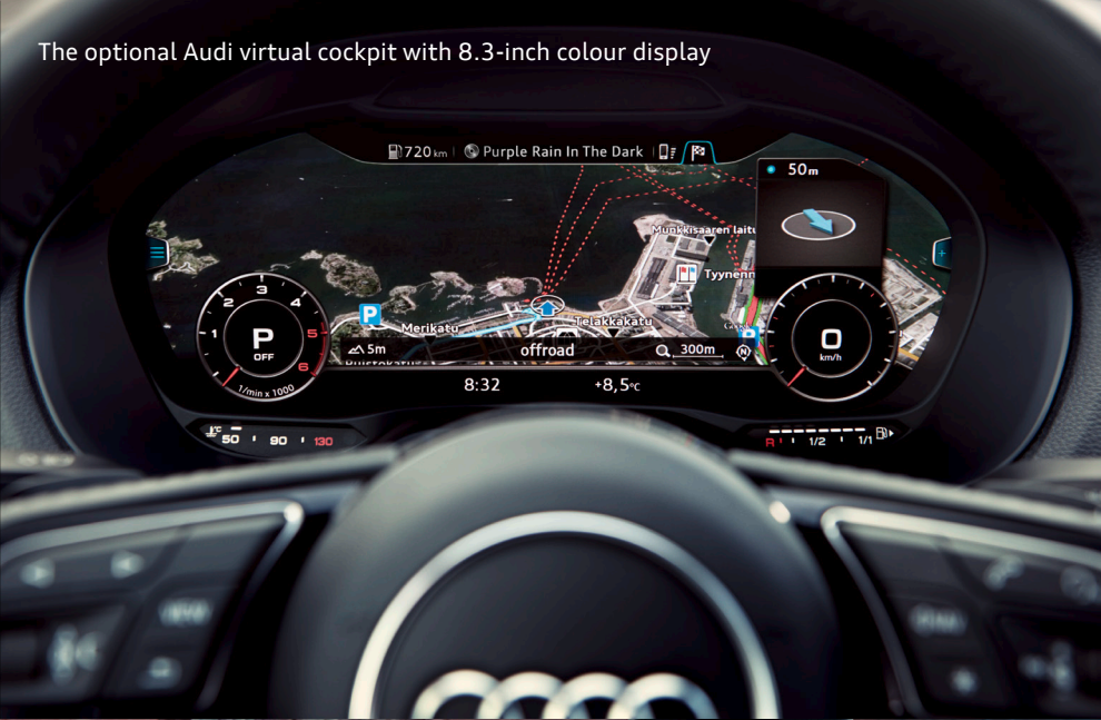
The optional Audi virtual cockpit with 8.3-inch colour display